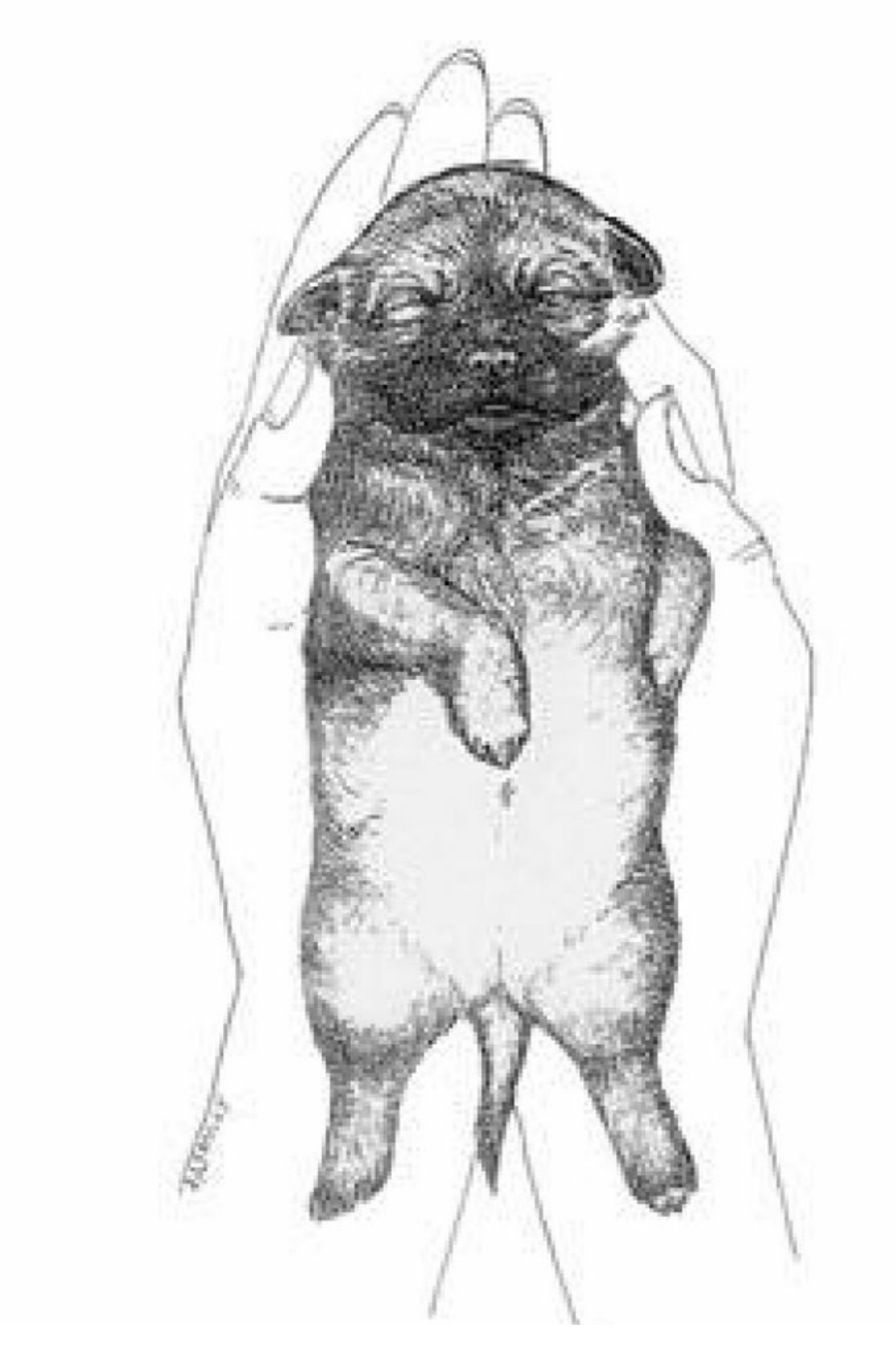
Figure 5 Thermal stimulation